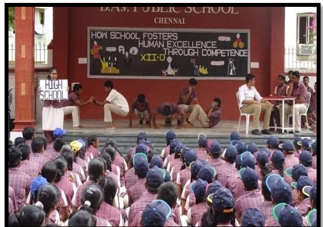
Team Work – Interpersonal Skills