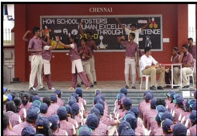
Mute Act – Academic Competence