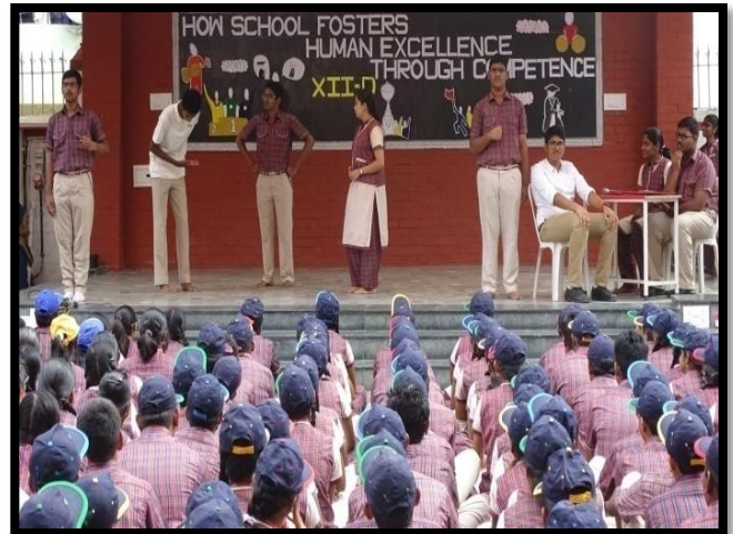
“ My school has made me Competent “ - An interview