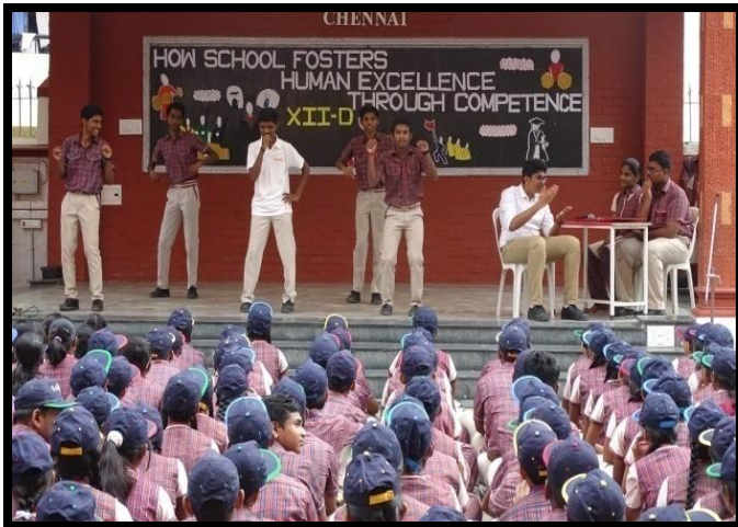
Act Portraying Ethical Competence