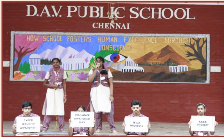
Melody on Conscience