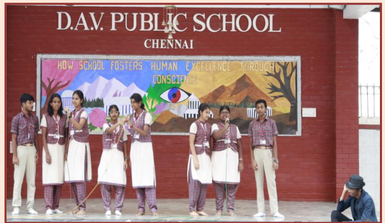
Glimpses of Conscious Acts