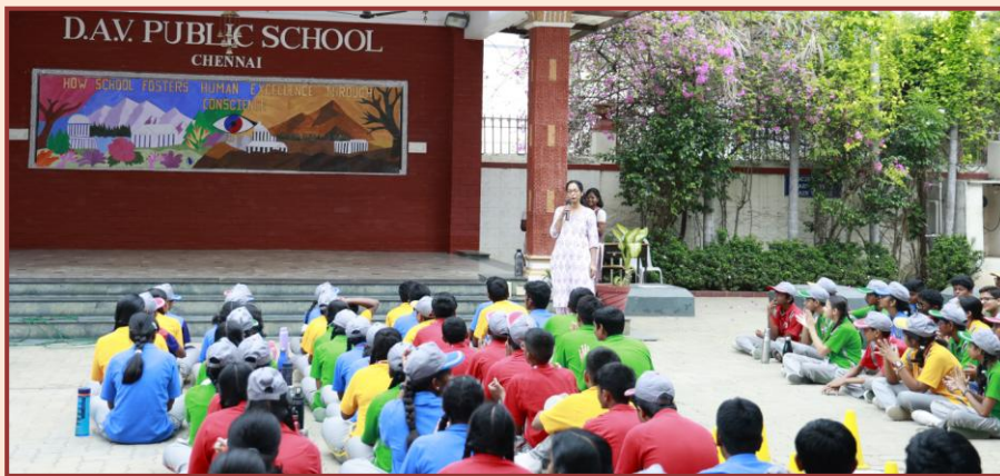
Insight of a Parent on the Assembly