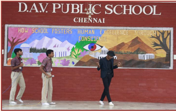
Game of Conscience