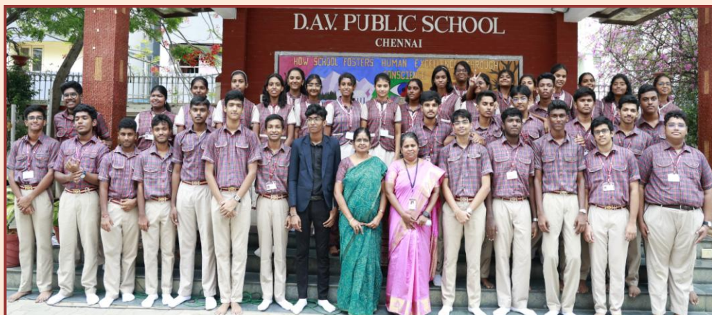
Game Masters of Class XII - C