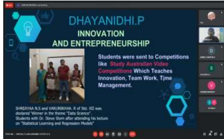
War of Words