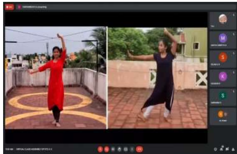
Dazzling Dance Performance – AGE Event