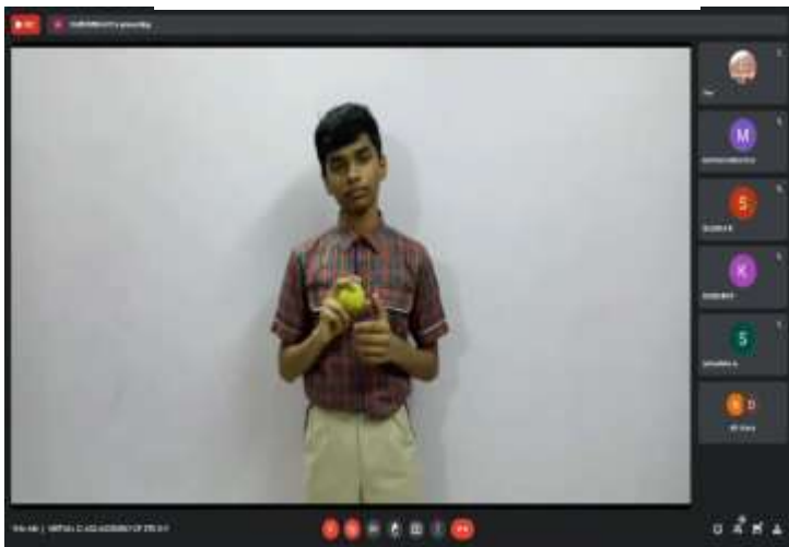
Tag your Merchandise - An Adzap Competition