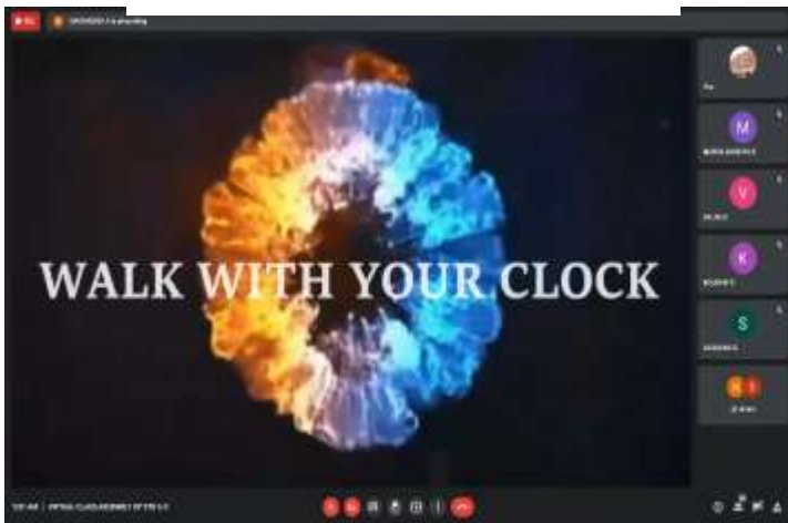
Walk with your Clock