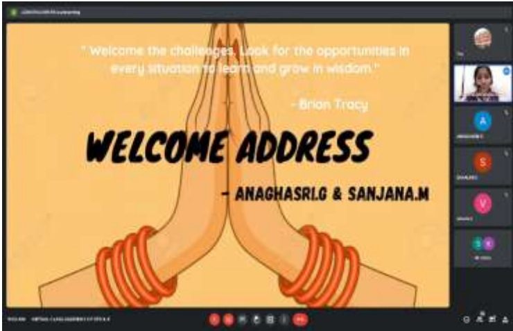
A Sweet and a Versatile Greeting to Welcome the Gathering