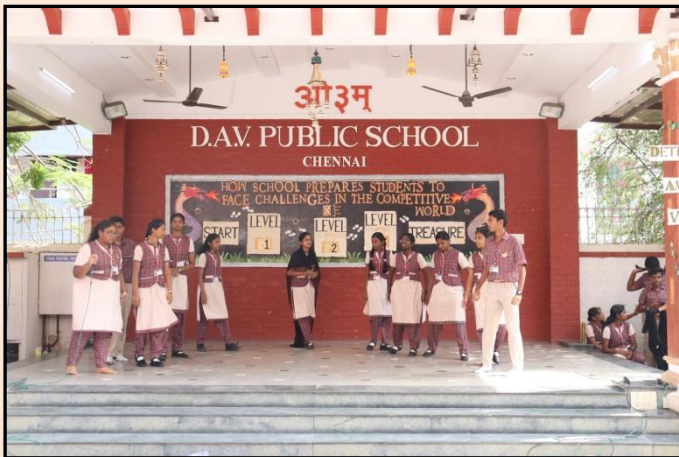
An arena of opposing views on Actions Vs Outcomes