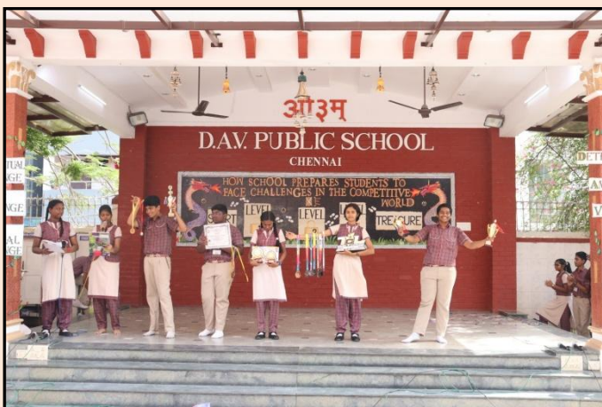
The courageous Challengers of X-E