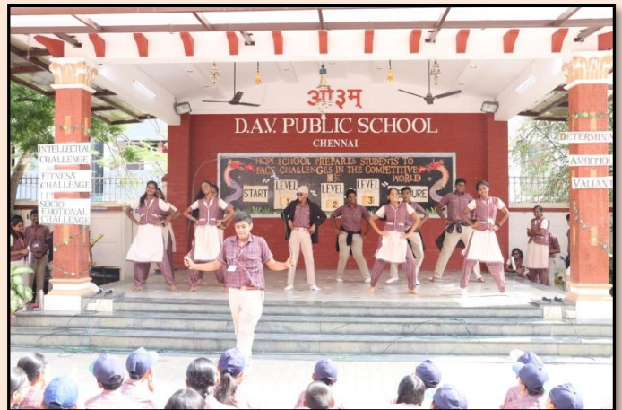
The enigmatic dancers amused the viewers with their rhythmic motions