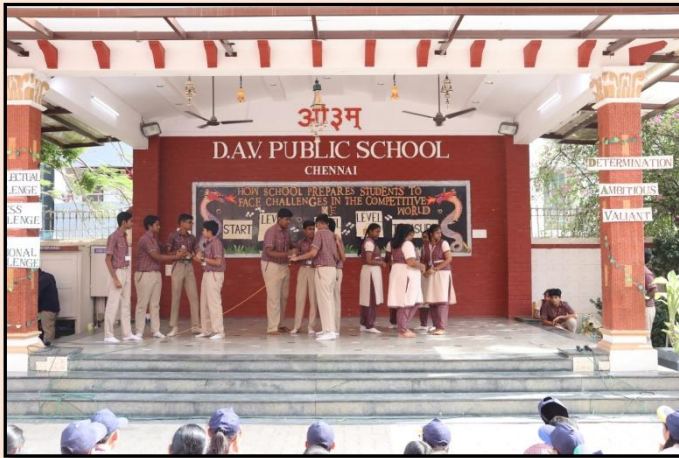
An engrossing depiction of 21 st Century skills