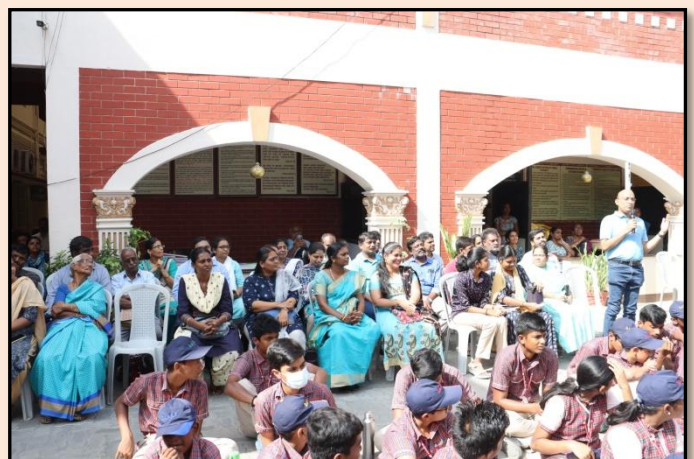
A proud parent's appreciation